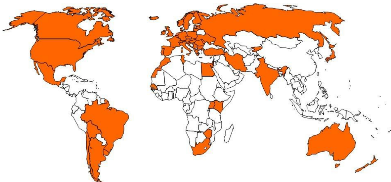
Figure 1 Map of Participating Countries in the OECD Seed Schemes (2016)